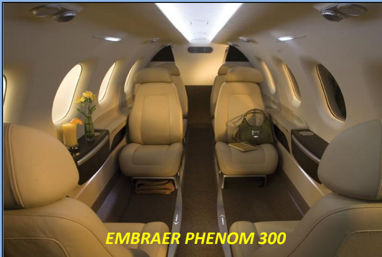
EMBRAER PHENOM 300