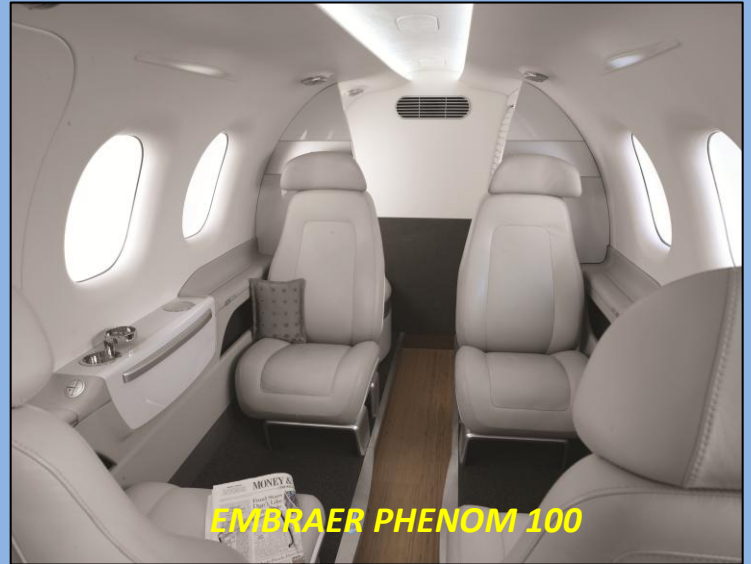
EMBRAER PHENOM 100